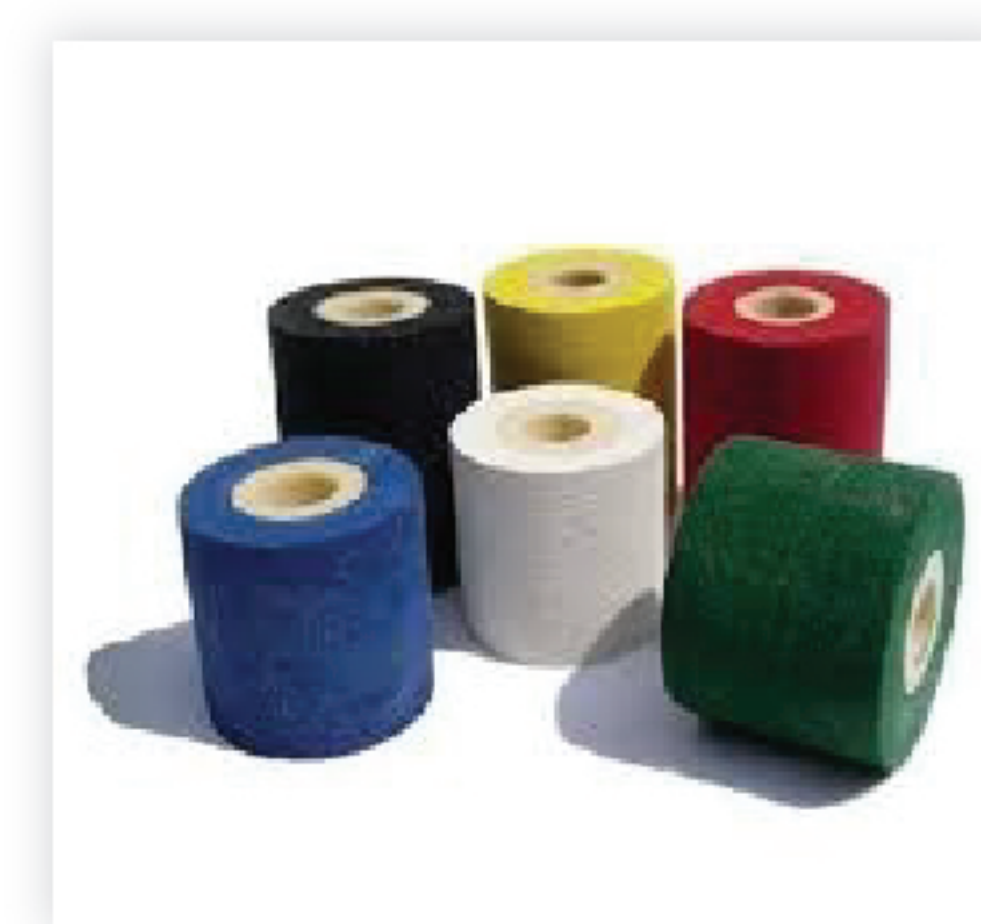
Hot Ink Roll